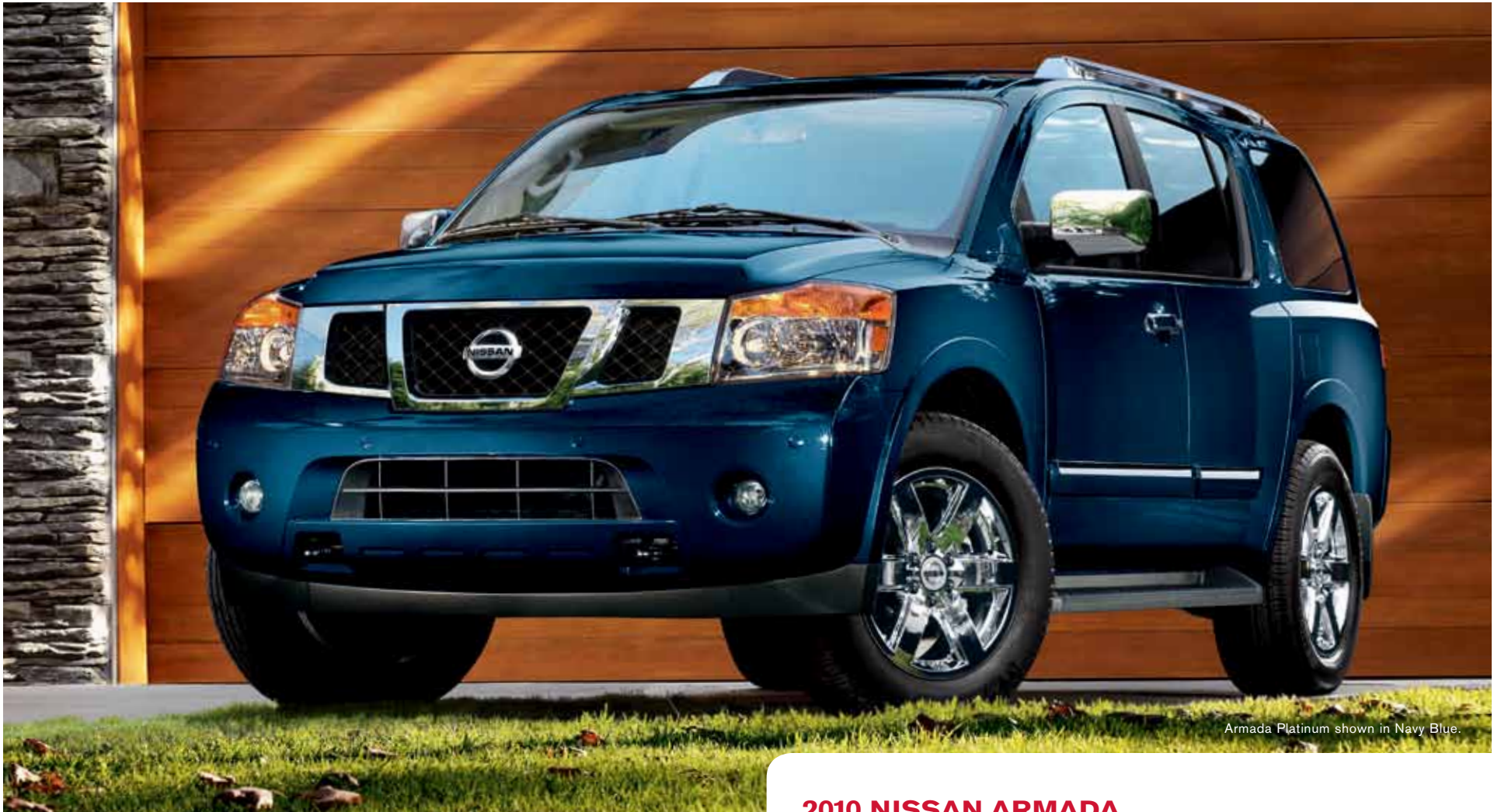
Armada Platinum shown in Navy Blue.