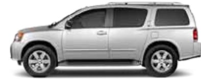
PLATINUM: THE COMPLETE EXPERIENCE