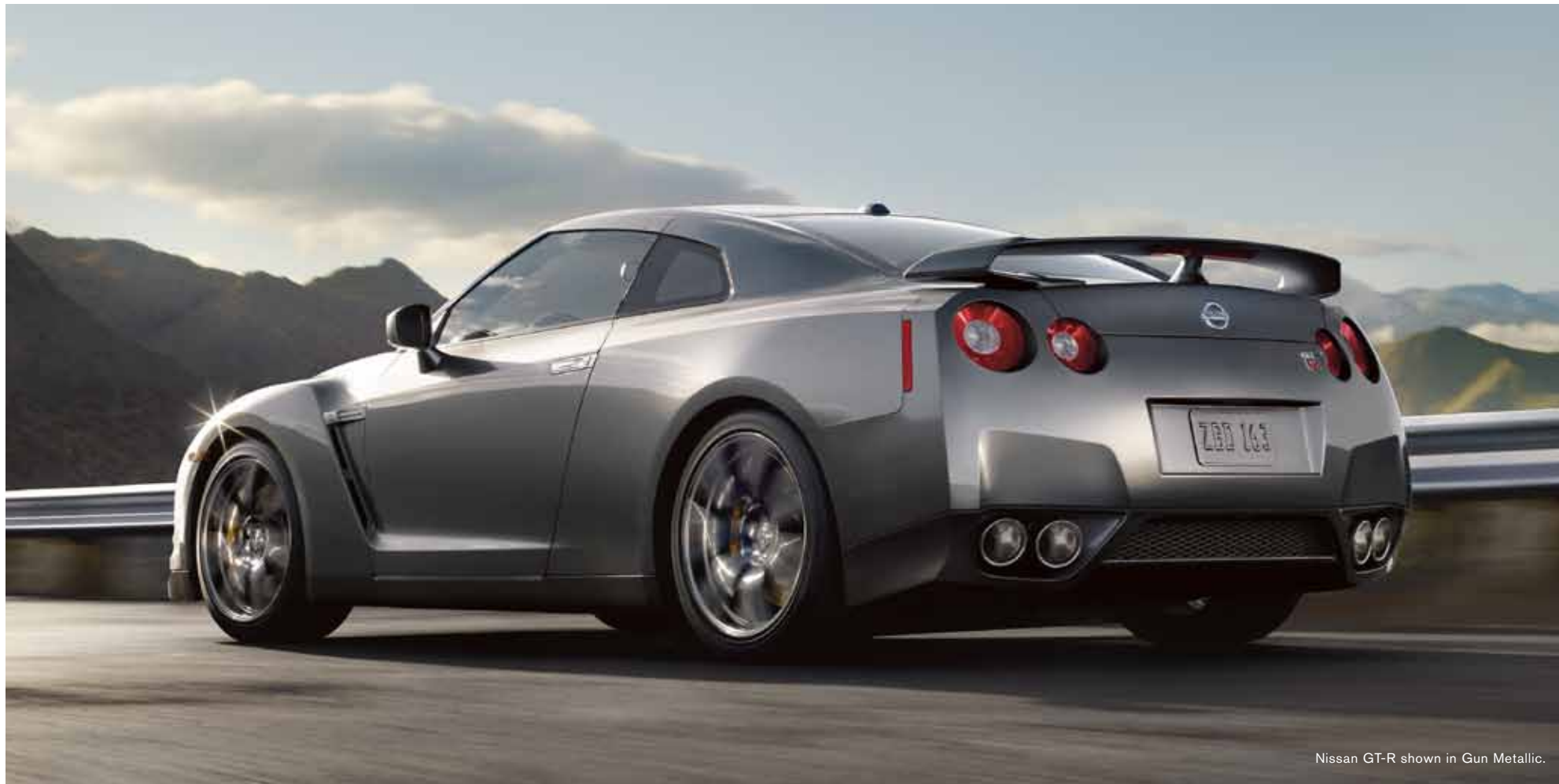
Nissan GT-R shown in Gun Metallic.