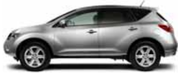
S: REDEFINITION OF ADVENTURE