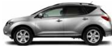
SL: STATEMENT OF BEAUTY