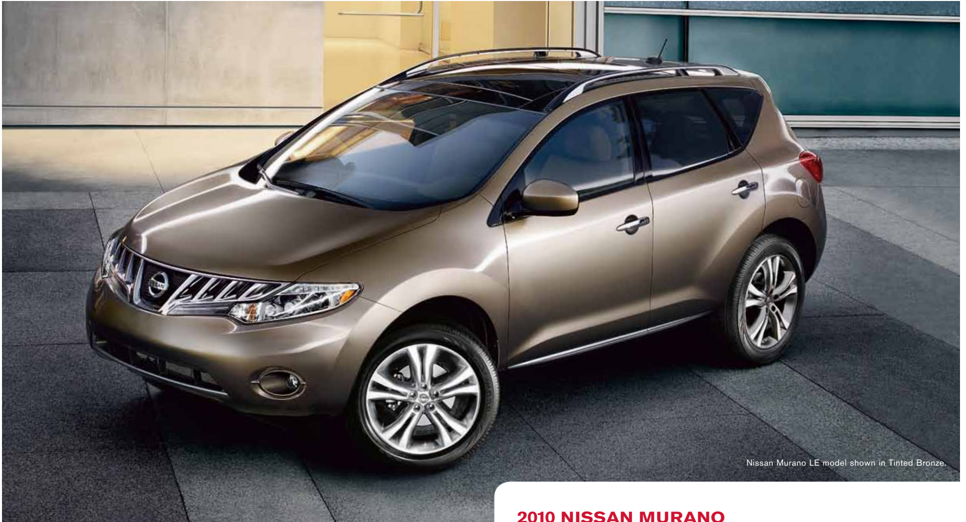
Nissan Murano LE model shown in Tinted Bronze.