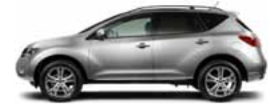
LE: PORTRAIT OF LUXURY