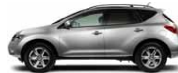
SL: WITH 360° VALUE PACKAGE